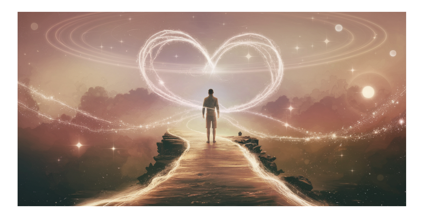
Navigating Love's Future